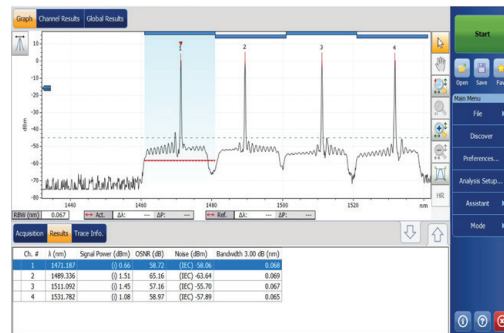
The FTB-5235 displays channel power, channel wavelength and OSNR. Above: example of CWDM network OSA display. Below: example of DWDM network OSA display.

Cable operators are not just rolling out CWDM and DWDM, they are deploying hybrid networks, where DWDM wavelengths are overlaid onto CWDM wavelengths, as well as Remote PHY. EXFO's new and compact FTB-5235 addresses all these applications with a single product, for maximum convenience.